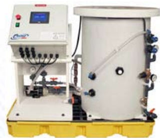
Constant Chlor® Plus MC4-150

The fresh made reservoir is filled with approximately 1.7% available chlorine solution and volume is maintained via an electronically controlled spray manifold. The hypochlorite disinfection solution is injected into the application with an appropriate, highly accurate positive displacement chemical metering pump specified for the application. Most metering pumps can be mounted directly to the pump mounting plate on the Constant Chlor® skid.